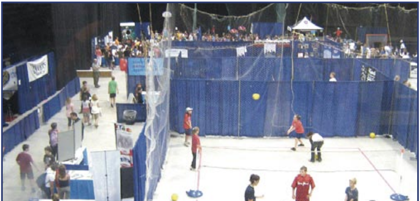
Milk Energy Sport Fair - Antigonish 2007