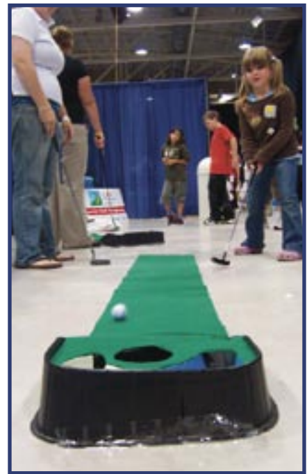
Little putter Milk Energy Sport Fair - Antigonish 2007