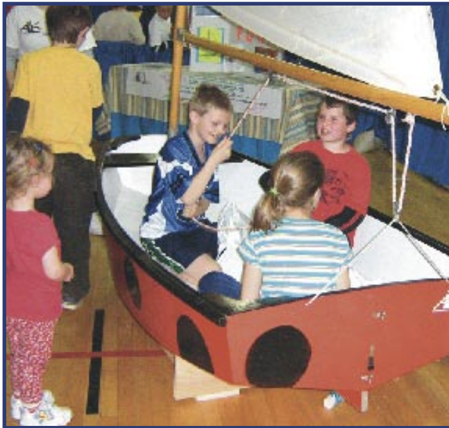
Yachting fun Milk Energy Sport Fair - Wolfville 2007