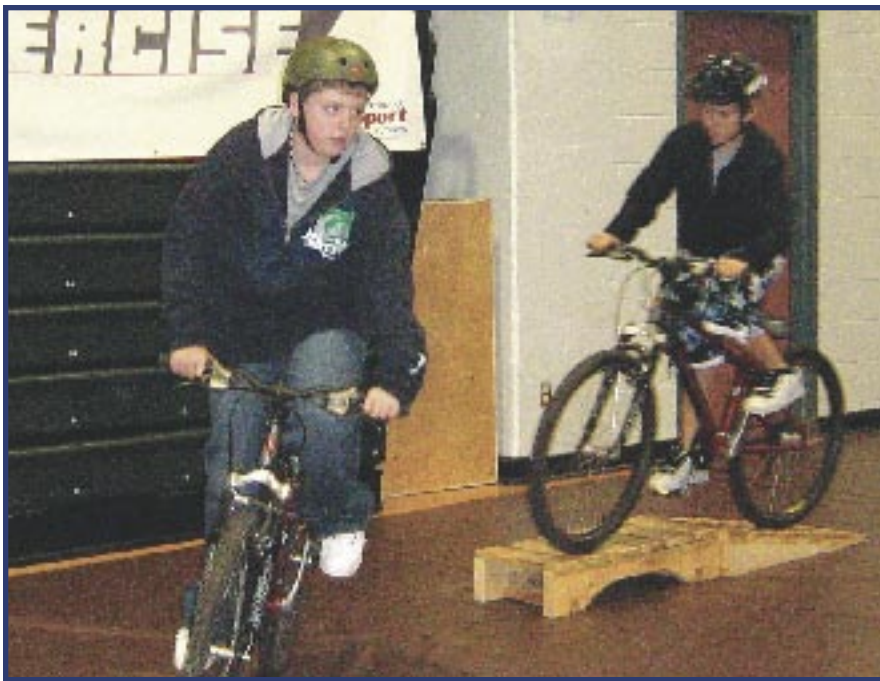
Bikercise is always a big hit! Milk Energy Sport Fair - Wolfville 2007