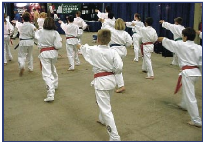
Tae Kwon Do demonstration Milk Energy Sport Fair - Halifax 2002