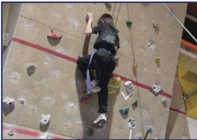
Tackling the wall Milk Energy Sport Fair - Halifax 2003