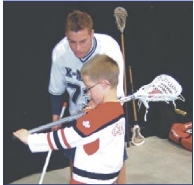
Lacrosse basics Milk Energy Sport Fair - Antigonish 2007

Just $2 per student provides you with the opportunity to help your students become more active.