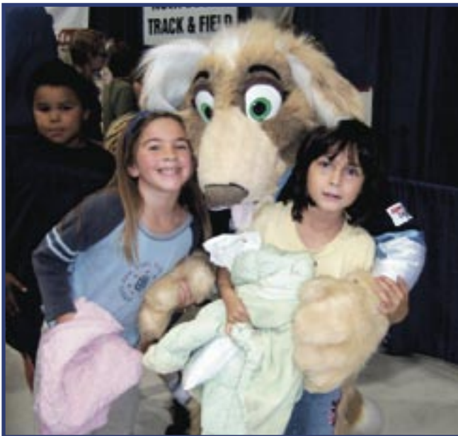
Pepper the PAWSable! mascot and her new friends Milk Energy Sport Fair - Antigonish 2007